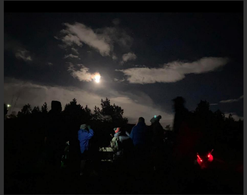
Guided Walk with a Highlife Highland Countryside Ranger to learn about nocturnal animals