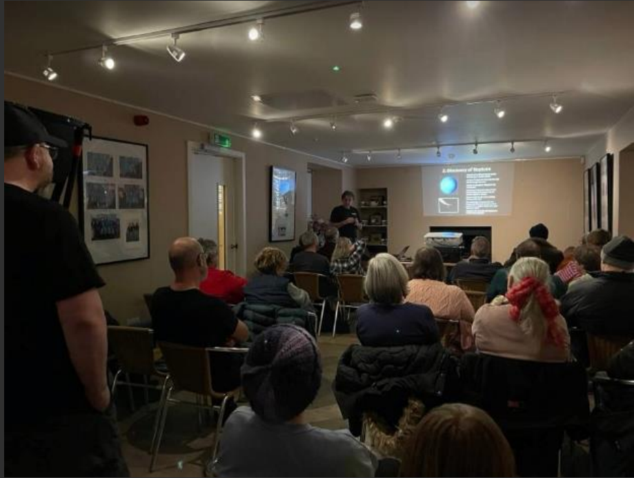
A talk by Cosmos Planetarium about Black Holes