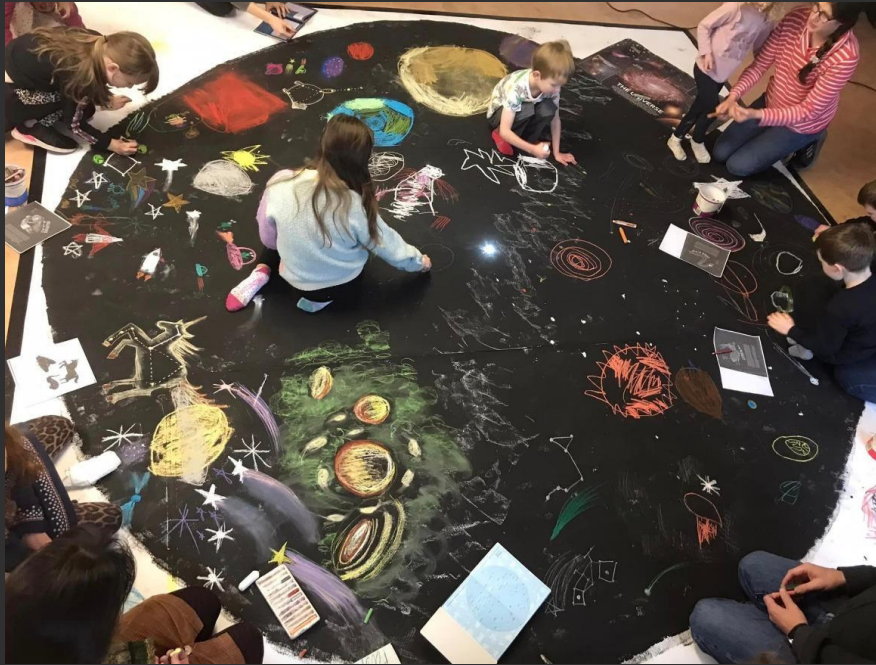
Astronomical art workshop