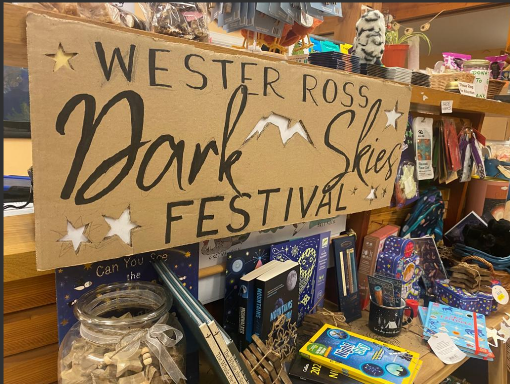
Left - handmade signage to promote dark skies related books and gifts at a community shop!